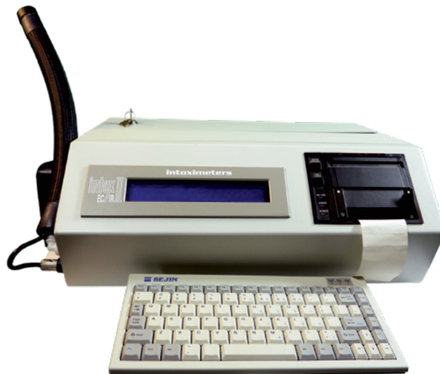
EC / IR II

The purpose of breath testing devices is to obtain a representative sample of ethanol expelled from the bloodstream and into the respiratory system through the lungs. Put simply, it seeks to capture what was most recently floating about in the bloodstream.